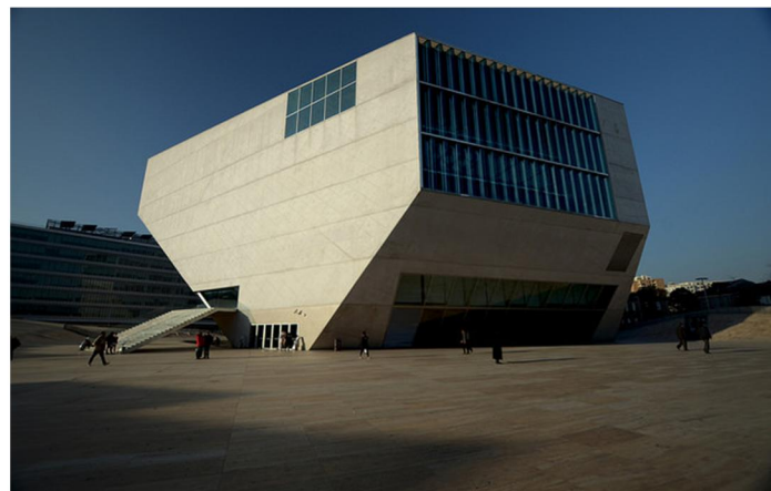
Casa da Música.

📍 Guimarães hosts various Europe for Festivals, Festivals for Europe-labelled festivals. During one of these - Guimarães noc noc - all artistic disciplines are exhibited in unconventional venues such as private houses, studios, cafés, squares and streets.